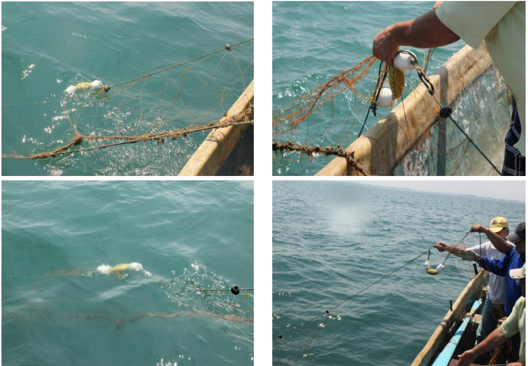
Fig. 8 - Verifying the turbot gillnets fitted with pingers

The verification of the operation of AQUamarck 200 and AIRMAR pingers, used to equip the turbot gillnets with the aim of reducing dolphin by-catches, was made by the CT 171 TOMIS boat, at 4-7 days intervals, depending on the weather (Fig. 8).