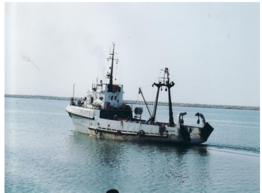
Fig. 4 - "Flamingo" trawler