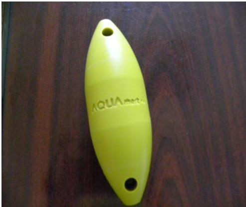
Fig. 1 - AQUAmark 200 pinger