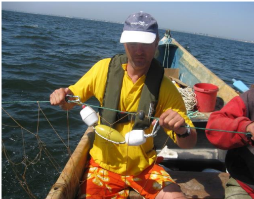
Fig. 5 - Fitting the gillnet strings with AQUAmark 200 pingers

For testing, two strings (gillnet strings) 10 gillnets each were used. One gillnet string was launched in the water without being fitted with pingers, being the witness, while the other string was fitted in the first half with AQUAmark 200 (Fig. 5) pingers and in the other half with AIRMAR pingers (Fig. 6). The pingers were set on the gillnet strings at approx. 200 m intervals (Fig. 7).