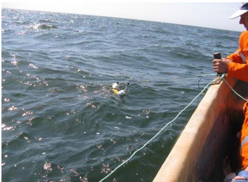
Fig. 6 - Fitting the gillnet strings with AIRMAR pingers