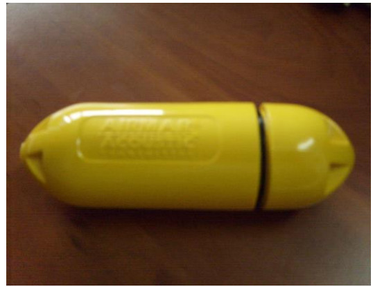
Fig. 2 - AIRMAR pinger