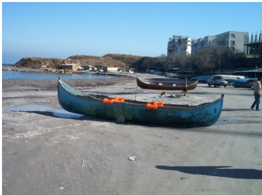
Fig. 3 - CT 171 TOMIS boat